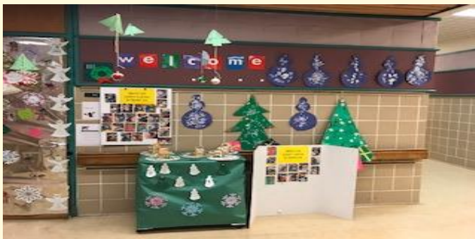
ART FROM ROOM 111

Coat, Hat, Gloves or Mittens, Scarf, Boots and a change of shoes, Snow pants, over the ankle socks, Sweater for in the classroom. Please Label items with name and room number.